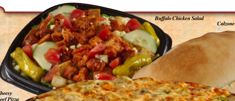
Buffalo Chicken Salad

Add Grilled Chicken Breast to Any Salad .....$3.00